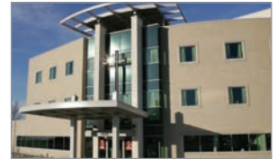
Alexian Brothers Behavioral Health Hospital Hoffman Estates, IL

For more than seven hundred years, the Alexian Brothers have cared for the sick, the aged, the poor and the dying. The basic Judeo-Christian beliefs that inspired the founders of this Catholic religious congregation sustain its ministry today. This heritage is espoused by the governance, management and entire health care team throughout Alexian Brothers Health System in their mutual commitment to promote the physical, mental, spiritual and social well-being of all individuals served through the health care ministry.