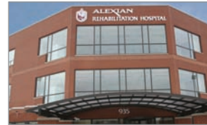
Alexian Rehabilitation Hospital Elk Grove Village, IL