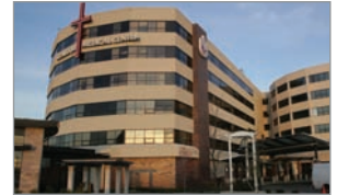
St. Alexius Medical Center Hoffman Estates, IL