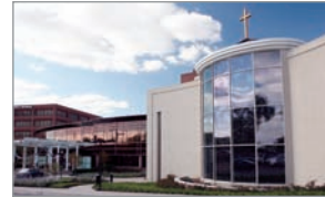
Alexian Brothers Medical Center Elk Grove Village, IL

Located in the northwest suburbs of Chicago, Alexian Brothers Health System includes four hospitals and conveniently located outpatient facilities serving more than two million people in our growing community.